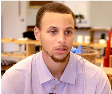
Stephen Curry talks about Montessori education in the AMS video.

Lawmakers in both the U.S. Senate and House of Representatives are considering ways to improve the delivery of Pre-K programs to students, and CAPE has an issue paper that offers principles to guide the development of such legislation. The issue paper is available for download as a PDF document on CAPE's Web site at < www.capenet.org/pdf/IP-EC2008.pdf >.