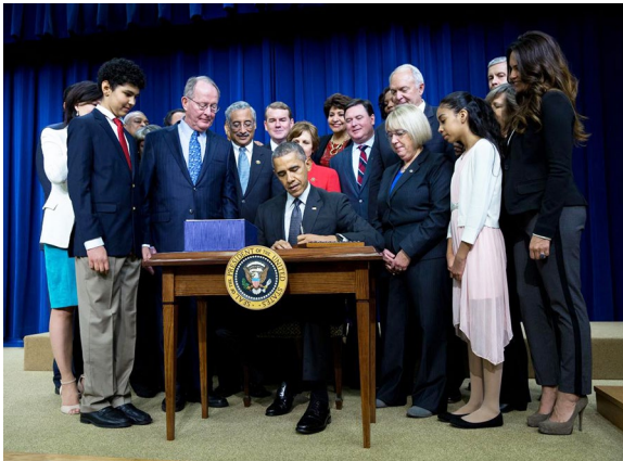
President Barack Obama signs ESSA, December 10, 2015.