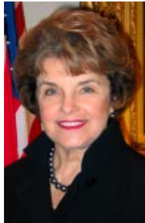
Sen. Dianne Feinstein (D-CA)

Feinstein's backing gave the measure significant forward momentum.