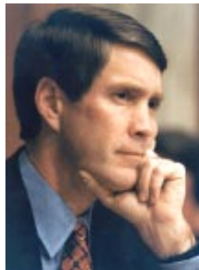
Majority Leader Bill Frist (R-TN)

ate passed the bill, Frist called the program “a beacon of hope for the children of D.C. public schools.” He went on to say that the program gives students and their parents “a choice and a chance at a brighter future.” Frist then praised Mayor Williams and Senator Feinstein, saying they “deserve tremendous credit for challenging the status quo and fighting for accountability and choice.”