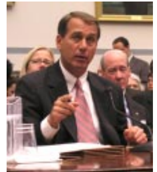
Rep. John Boehner (R-OH) testifying last year at D.C. school choice hearings.

To be sure, the legislation had its share of opponents, too. And apparently they are even now determined to derail the voucher train before it leaves the station. The Washington Post reported that at a rally of voucher opponents held after the Senate vote, Senator Edward M. Kennedy (D-MA) and Delegate Eleanor Holmes Norton (D-DC) “said they would attempt to repeal the voucher program and send the money to public schools.” Kennedy was quoted by The Post as saying, “Even after this vote, don’t bank on vouchers coming to D.C.”