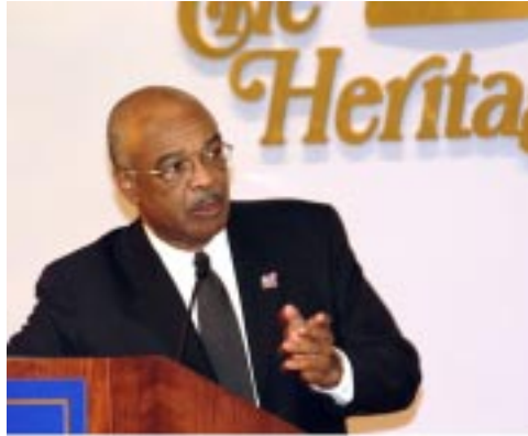
U.S. Education Secretary Rod Paige at the Heritage Foundation, January 28, 2004.

school, the record of achievement of the students in that school, student expectations (such as uniforms and required classes), and the safety and environment of the school.”