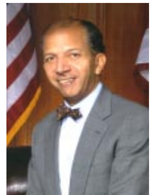
D.C. Mayor Anthony Williams

Last September the Senate Appropriations Committee approved the plan only after Senator Dianne Feinstein (D-CA) broke ranks with her party to endorse the bill.