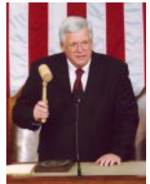
Speaker Dennis Hastert (R-IL)

The Post also offered its own ideas about program design. Arguing that a voucher plan in